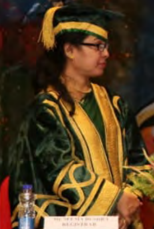
THE SECRETARY RECEIVED